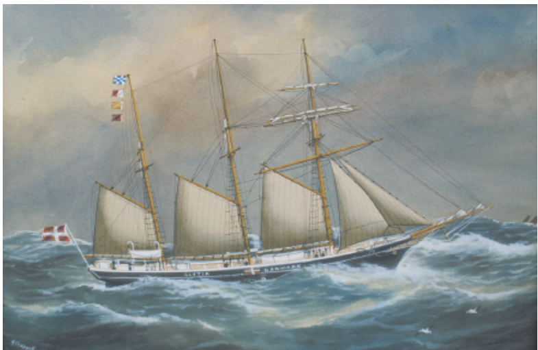
Clytia of Thurø. Troense Søfartsmuseum