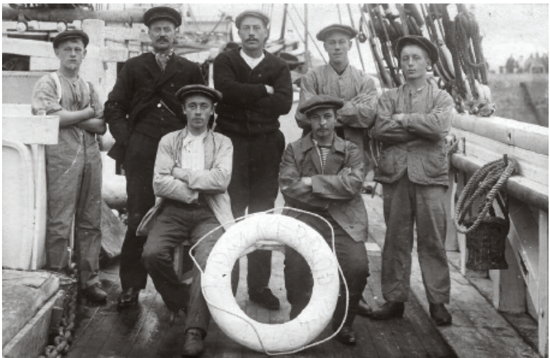
Above: Crew of Dannebrog.